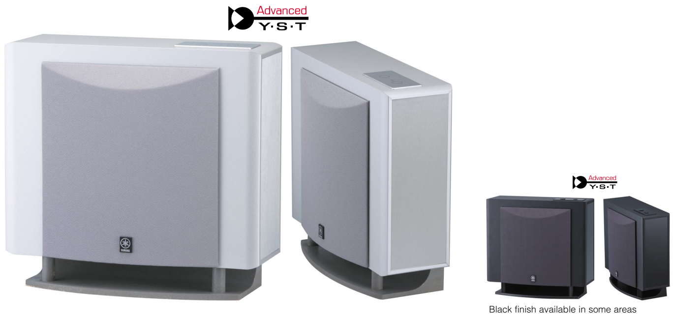
Black finish available in some areas