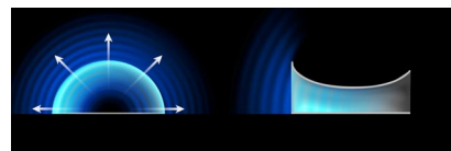
A semicircular Half Pipe Port provides the benefits of full 180° dispersion when placed against a wall, compact design and minimal extraneous noise for high sound quality.